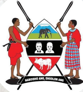
Kajiado County Government